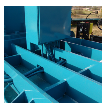
The Galaxy 2R wide model model features a heavy-duty reinforced honeycomb structure for maximum performance.