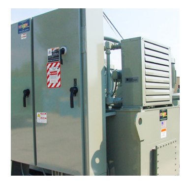
High-efficiency power units available from 2x 30 HP up to 2x100 HP.