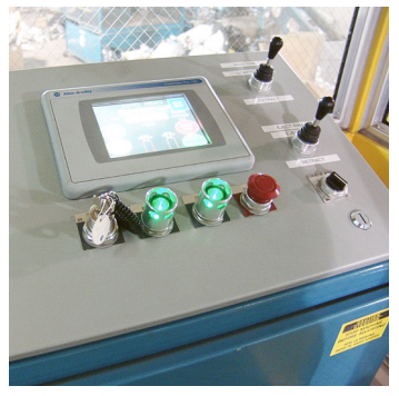
Color touchscreen operator interface PLC programmable controller features automatic and manual controls, diagnostics and bale set-up functions. Available with multi-language function.