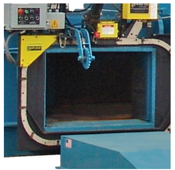
Multi-purpose door can serve as a bale separator, bale release, or bale clamp. It also allows for variable bale widths