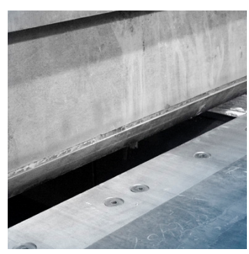
The optional stamper anti-jamming system activates automatically while in Auto Mode to help prevent shear jams before they occur. This reduces downtime and maximizes safety by preventing troublesome shear jams.